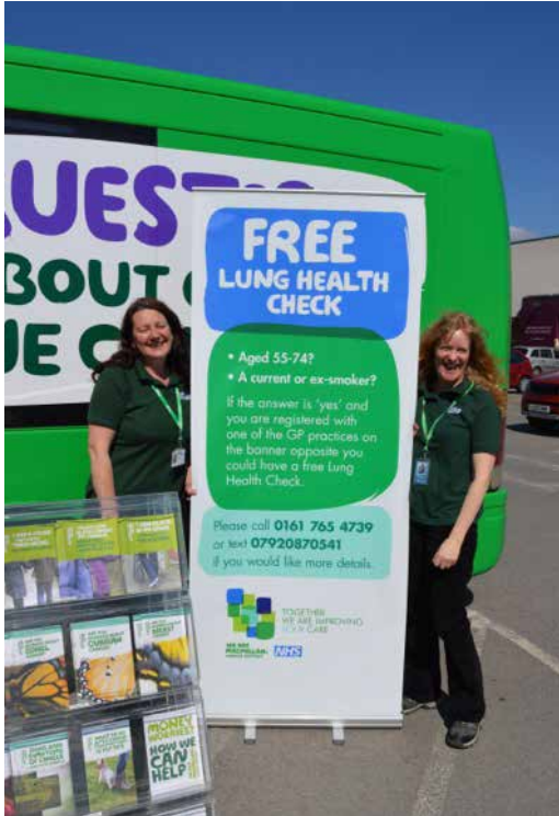
The Macmillan Information and Support Service bus staff joined forces with the CCG's engagement team and Manchester City Council Libraries Macmillan Information and Support staff to publicise the pilot by Gorton's Tesco

Local community engagement was used to publicise the pilot service in areas around the one-stop shop locations including local shops as well as GP waiting rooms.