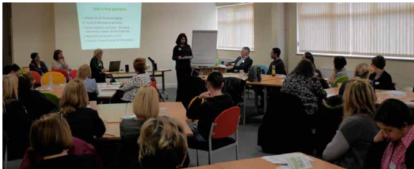
MCIP stakeholders at one of the programme's early scoping meetings